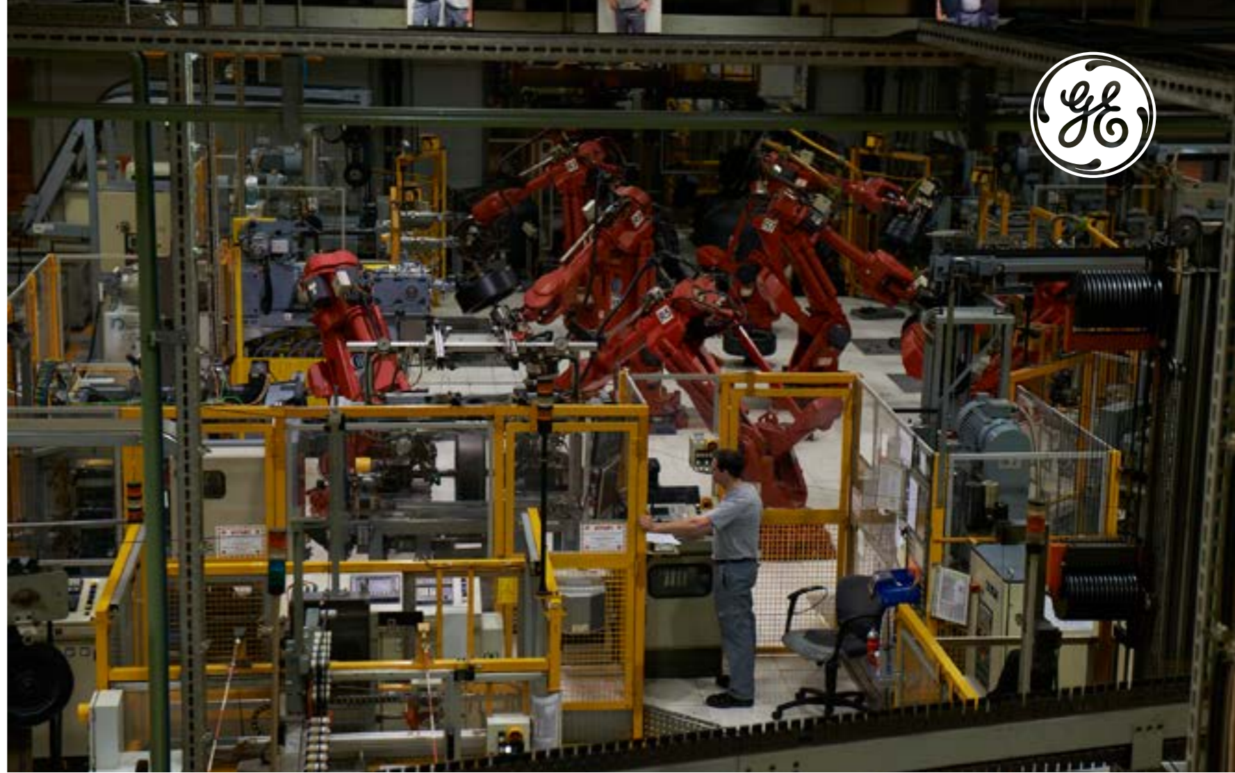
Fig. 3: Robotized tire production with MIRST™ technology: Unrivaled precision at breathtaking speeds with a very small footprint

"Quality is the central claim of our tires as a premium product," underlines Beck. Each production run is therefore finalized with the visual inspection of each tire by an