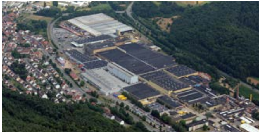
Fig. 1: The Pirelli location in Breuberg, Odenwald.

Breuberg, located around 30 kilometers east of Darmstadt, is home to the head office of Pirelli Deutschland GmbH, and doubles as the manufacturing and development location for Pirelli car and motorbike tires (Fig. 1) in partnership with