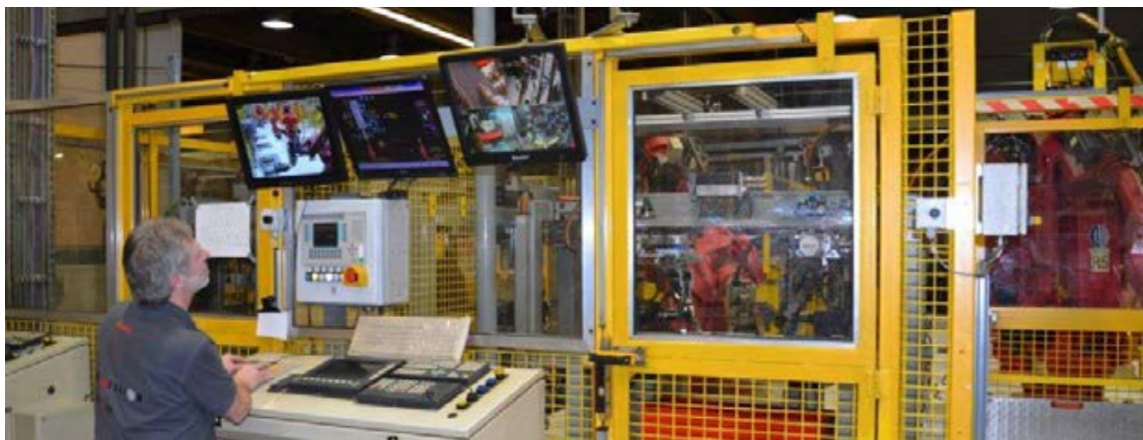
Fig. 4: Everything at a glance: Bernhard Munzert viewing a Proficy HMI/SCADA iFIX-generated real-time overview of the MIRS™ production processes in Breuberg.

"An important advantage of iFIX – particularly in view of the need for processing high data volumes – is the system's distinctive real-time capability," stresses Kara. Highly performant algorithms in conjunction with state-of-the-art hardware ensure a true "online" view of running production.